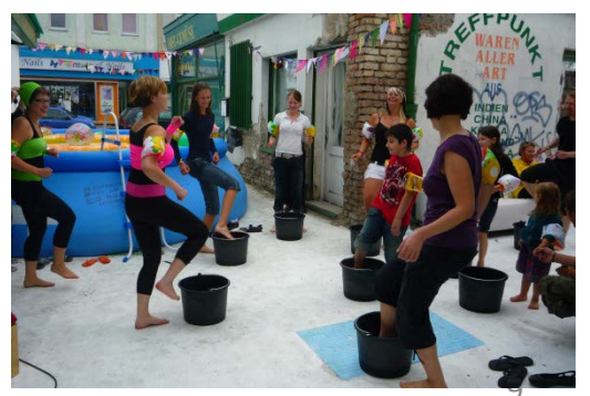
Temporary cultural use of an old market, photo: Steffi Sandhäugl