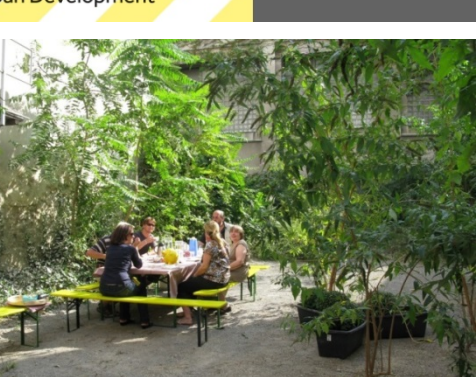
Garden for one summer; Photo: GB17