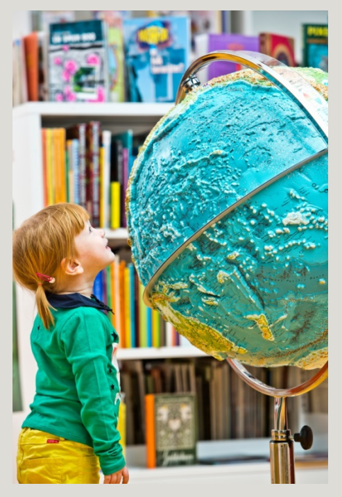
Odense Library